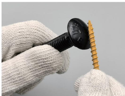
Superior Anti Peeling off Feature